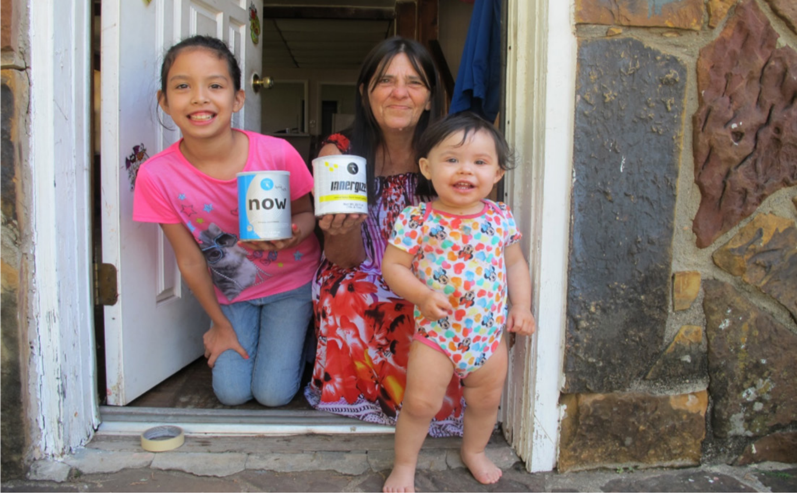
Lighthouse Ministry Nutrition Program – Oklahoma City, OK Mount Saint Mary's Abbey – Wrentham, MA